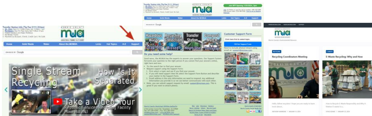
The first two images illustrate where to find the support page on the homepage and what it looks like to the public. The bottom two images are taken from the website's footer, displaying news feeds and the MCMUA News Landing Page.

In January 2024, the supervisors of the two departments met for a third month for the MCMUA’s Project Dependence Meetings. Conducted bi-weekly to work collaboratively on internal projects, shared service agreement matters, curbside operations improvements, waste reduction efforts, and recycling enhancements. The discussions from the January meetings covered a range of topics, including updates to our existing Shared Services Agreements, temporary recycling requests received into the MCMUA, the completion of our new customer support and program news pages for the MCMUA webpage, the purchasing of a GPS-based vehicle software system and cameras for the recycling operations of vehicles, staffing management, and other operations-based matters. Discussions like these are beginning to improve our internal and external processes while allowing us to work collectively on mutually beneficial goals with established deadlines.