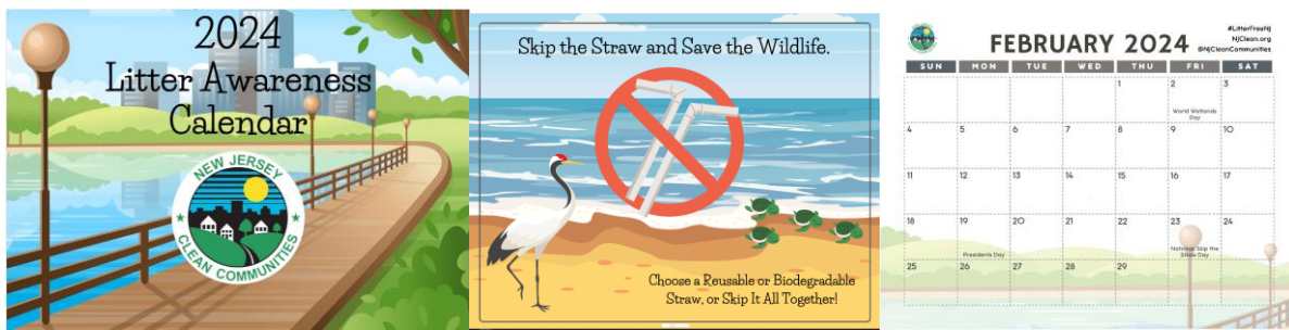
Pictured above are images from the NJ Clean Communities education calendar.

will be provided to the MCMUA Board members in attendance at the February 2024 Board Meeting.