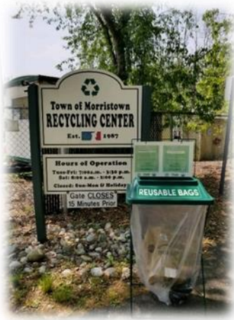
Above is a photo of the collection container for reusable bags at the Morristown Recycling Center.