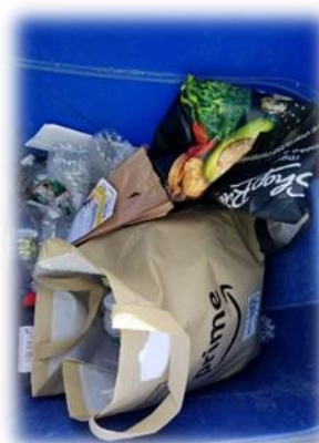
Borough of Chatham residential recycling setouts tagged and stickered for contamination issues. The two photos show plastic wraps and bags tagged for non-collection left curbside on the left and right, a recycling container with reusable shopping bags marked as recyclable with the numbers #2 and #5.

MCMUA and the Association of New Jersey Recyclers (ANJR) Joint Efforts: The Recycling Administrative Staff hosted ANJR's Swap and Share Northern Educational Event at the Morris County Library's public meeting room on May 18, 2023. The gathering was attended by over 50 recycling and industry professionals who had the chance to exchange ideas and collaborate to find solutions to common problems.